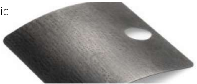
Light Peltrox Fabric