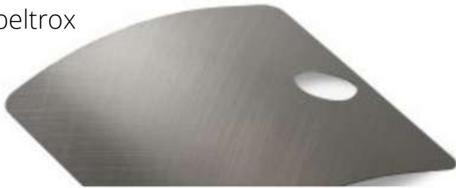
Crossed filed peltrox