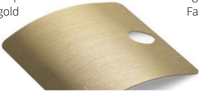
Empire soft gold